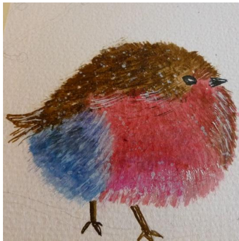
Sue's fluffy robin

Meet at 10.30am on Wed 21st Dec at EDEN bistro, Ashby Road, Moira. (Car sharing can be arranged)