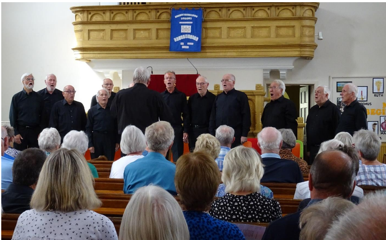
Consensio Choir in full voice